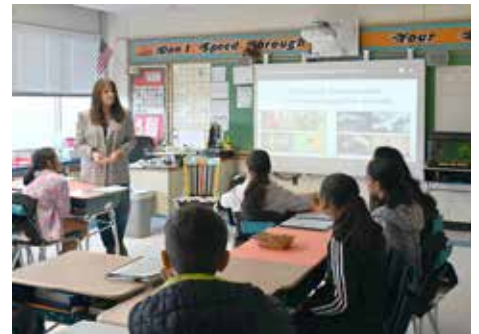
Fifth graders at Old Country Road learn about how animals camouflage themselves to hide from predators.